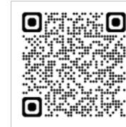
Army Equity and Inclusion Agency