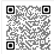
Army Career Tracker