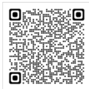
Army Training Network