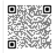
Center for Army Lessons Learned