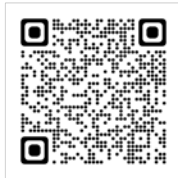
Army Publishing Directorate