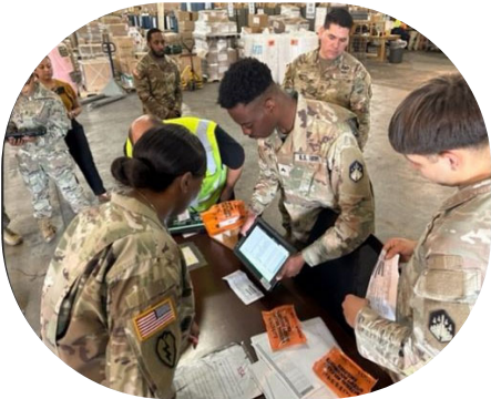
Soldiers use the HHT to pick up items at the SSA. 3rd DSB, Fort Stewart, GA

For more information regarding what the SASMO roles and responsibilities include, or for training and class dates provided by the Army Sustainment University (ASU), please scan the QR code on the back of this pamphlet to visit their website.